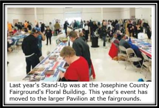
Last year's Stand-Up was at the Josephine County Fairground's Floral Building. This year's event has moved to the larger Pavilion at the fairgrounds.

The third annual Southern Oregon Veterans Stand-Up and Employment Fair is set for Friday from 10 a.m. to 2 p.m. at the Josephine County Fairgrounds Pavilion. Veterans, homeless veterans, and family members are invited to attend.