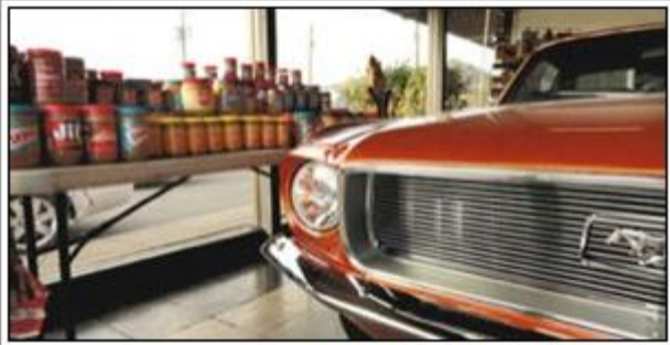
Three tables loaded with peanut butter donations of all sizes share the Grants Pass Kelly's Automotive showroom with a classic Ford Mustang. The donations are heading to the Josephine County Food Bank, from the fifth annual "Wipe Out Hunger" food drive.

Kelly's Automotive Service collected a record 775 jars of peanut butter during its fifth annual "Wipe Out Hunger" drive.