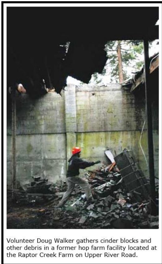
Volunteer Doug Walker gathers cinder blocks and other debris in a former hop farm facility located at the Raptor Creek Farm on Upper River Road.

The nonprofit Friends of the Josephine County Food Bank is seeking volunteers for a clean-up day on Feb. 25 in order to get the Raptor Creek Farm land on the River Road Reserve prepared for additions to the farm, which grows fresh food for the bank.