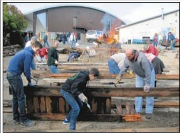
About 60 volunteers that showed up to help clean the old warehouse at Raptor Creek Farm Saturday.